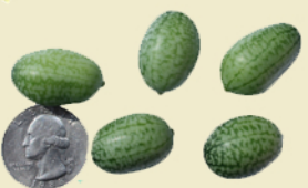
Tiny Veggies Cucumber