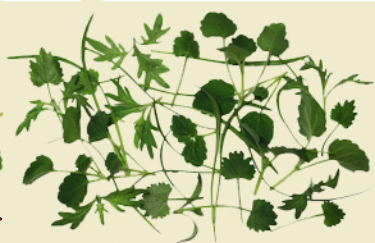
Micro Absinthe Mix