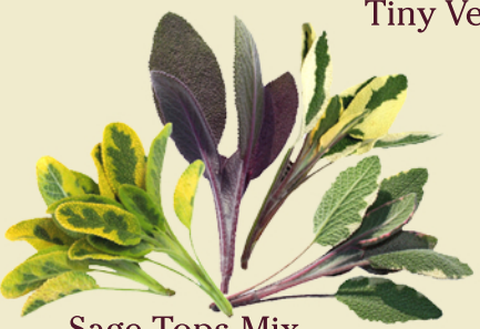
Sage Tops Mix