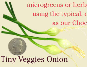
Tiny Veggies Onion

Fresh Origins has several exciting products for beverage applications. Mixologists are finding that microgreens, herbs and edible flowers are a fantastic taste ingredient and beautiful garnish for all kinds of cocktails! Microgreens or edible flowers can invigorate any liquid creation, raising the bar for freshness, creativity and flavor. Simply floating an edible flower can change the look and increase value. Muddling microgreens or herbs will add their intense fresh flavors. Instead of using the typical, ordinary spearmint, try a unique variety such as our Chocolate Mint to really enhance cocktails!